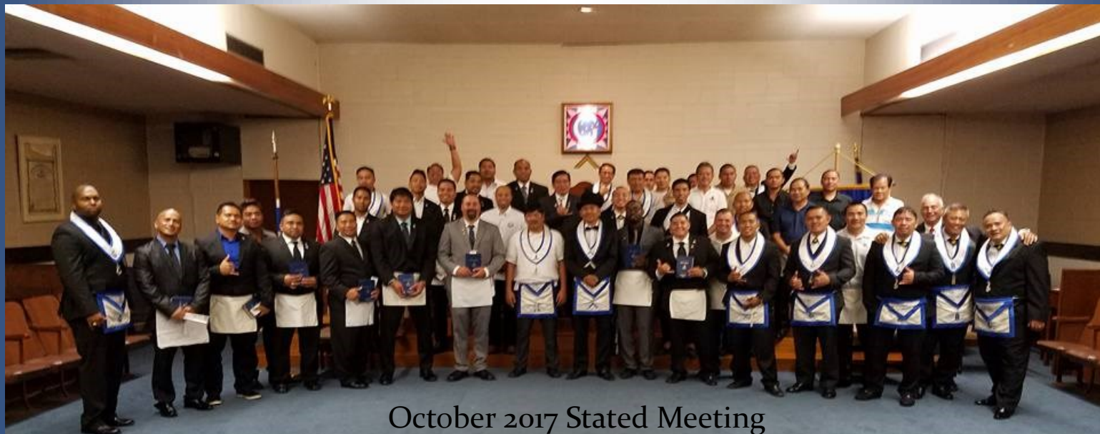
October 2017 Stated Meeting