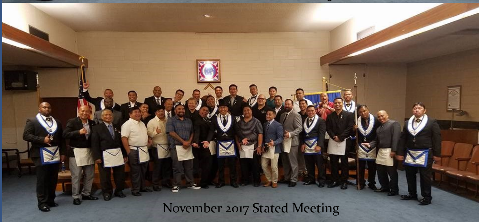
November 2017 Stated Meeting