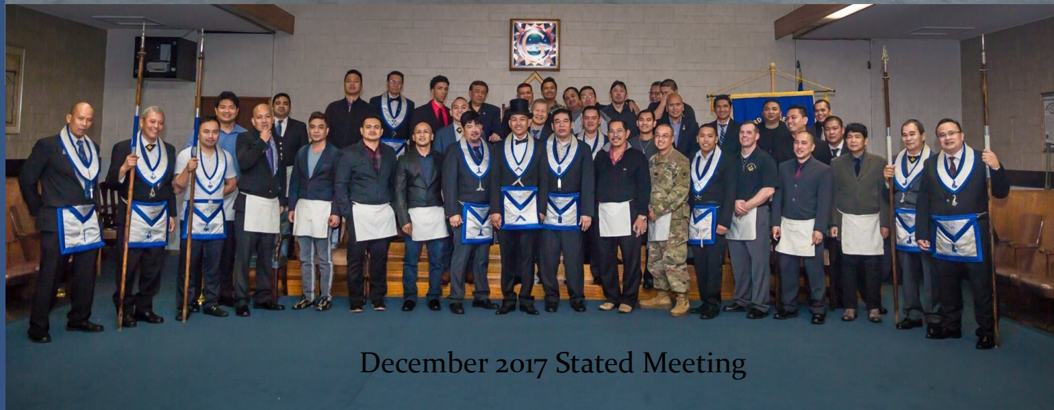
December 2017 Stated Meeting